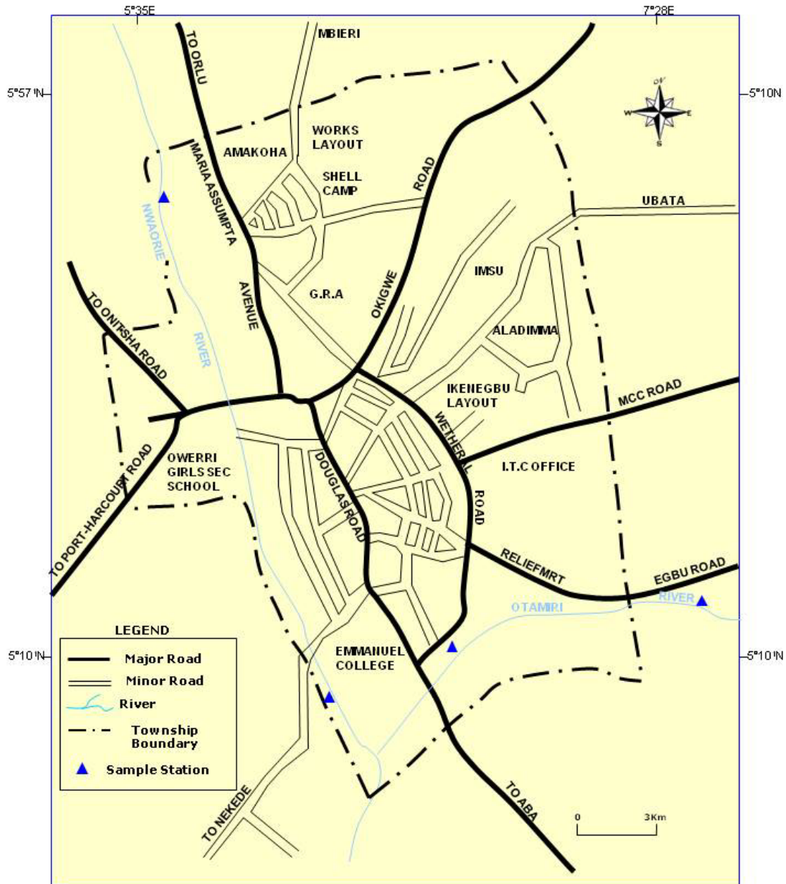
Fig. 1 Owerri showing samples stations

downstream (OT2). Samples were collected from where the natives abstract drinking water. Up-stream sampling was done at Nwaorie at Maria Assumpta Avenue and down-stream at Nwaorie at Nekede Bridge. Up-stream sample of Otamiri Rwas done at Egbu road while the down-stream was sampled at Wetheral Road. The samples were collected and labeled for easy identification.