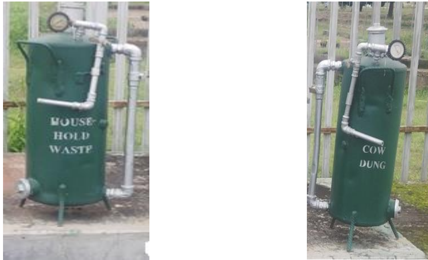
Fig. 1 Anaerobic biodigester used for biogas production

gas agitators with regulating valves and filters, an inlet to feed the reactor and outlet to remove the digested slurry. It has gas outlet to collect the crude methane gas, pressure gauge to measure the pressure within the reactor and a highly resilient adhesive and plastic seals to prevent leakages within the reactor (Fig. 1)