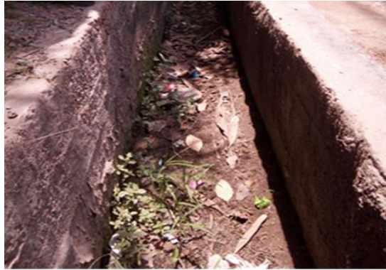
Fig. 3 Totally dry drain