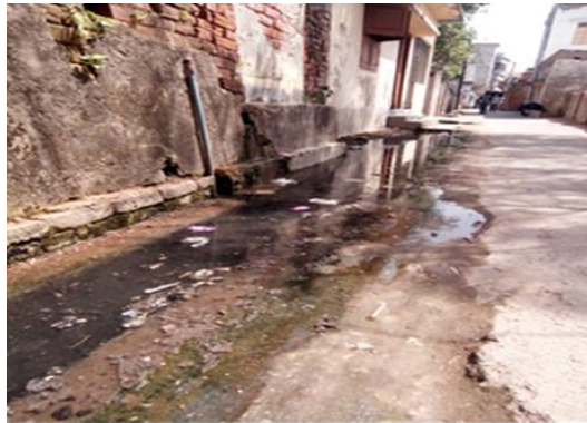
Fig. 4 Water stagnant drain

bituminous layer of pavement. From field observation, it was found that the road experienced edge damage, raveling, and cracking at different portions of the road. As previously described, stagnant water is a breeding place of other disease vectors like mosquito can transmit diverse infectious pathogens and parasites that cause diseases such as dengue, Zika, Chikungunya, or malaria. So, passers-by who cross the road beside these drains have to suffer the bad smell causing different health issues.