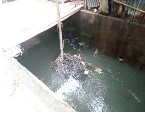
Fig. 5 Obstruction inhibiting the natural flow of drain