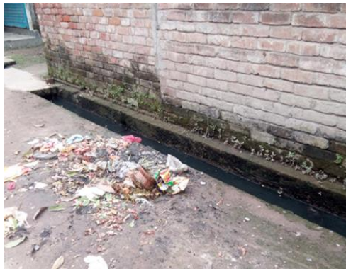
Fig. 7 Domestic waste materials thrown near drain

During the field investigation, illegal sludge disposal was found at different locations in the city. Due to ignorance of solid waste management, People in the residential area and also pedestrians throw their waste after their use near the drain, which increases the amount of sludge in the drain when they are swept away and washed by stormwater. A typical scenario can be seen in Fig. 7. Due to the increase in population density, demand for constructing buildings and houses