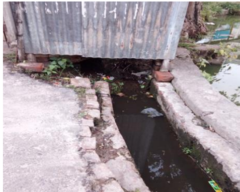
Fig. 6 Construction over drain interrupting the cleaning work