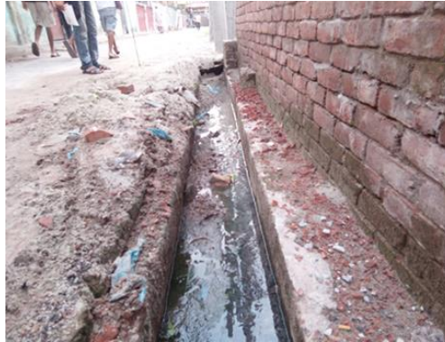
Fig. 8 Accumulation of construction materials due to improper maintenance

is increasing day by day. But, knowledge of proper maintenance of building materials is necessary. Due to lack of appropriate maintenance, construction materials come into drains and add to the drain's sludge. Fig. 8 shows a drain with a thick slurry of cement, and water covered the maximum depth of drain. This slurry hardened with time after a permanent setting. As a result, the capacity of the drain decreased to carry sewage water.